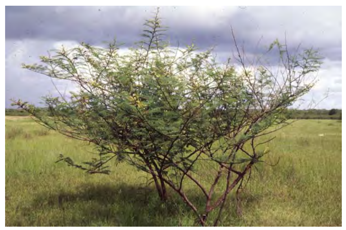
Leaves will close up when touched. Found in wet areas and floodplains